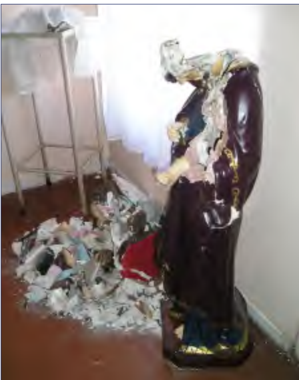
At left, these statues of Mary and Joseph in our neighborhood chapel had just been beautifully restored by a group of our women. The crucifix, also restored, held to the wall and survived.