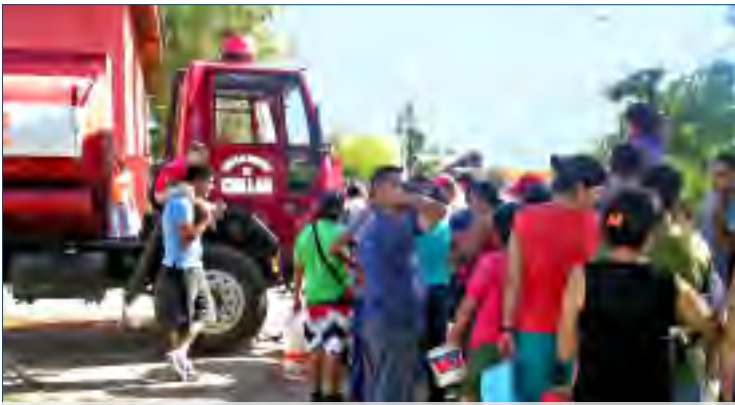
Fire trucks deliver water to people throughout the city, including this group lined up in front of our neighborhood chapel.