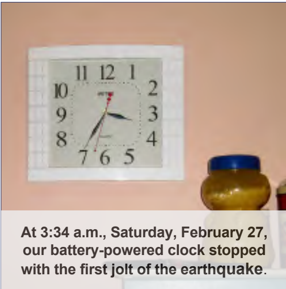
At 3:34 a.m., Saturday, February 27, our battery-powered clock stopped with the first jolt of the earthquake.