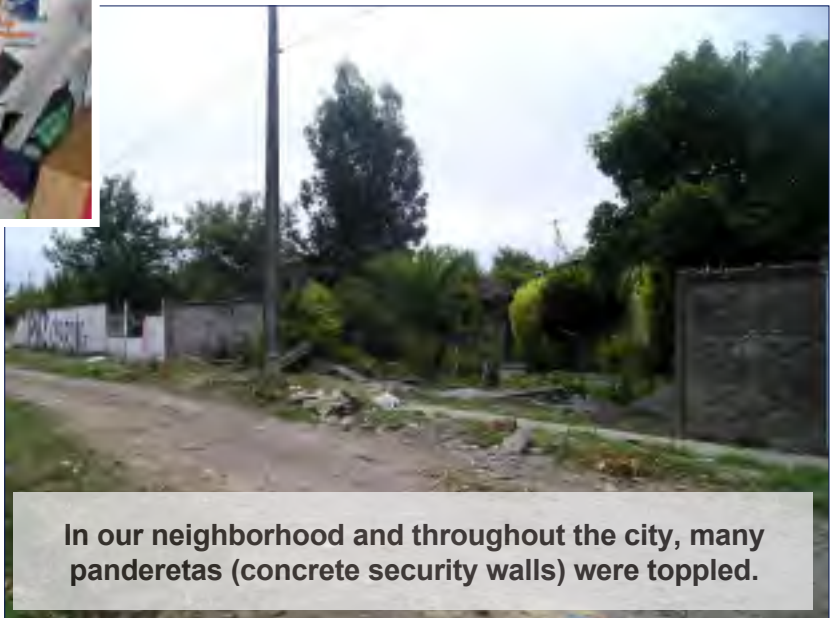
In our neighborhood and throughout the city, many panderetas (concrete security walls) were toppled.