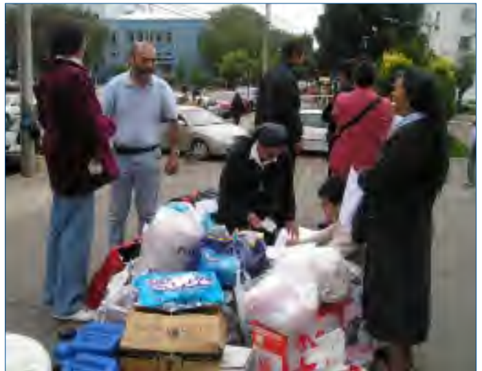
Above right, a group of volunteers collects supplies on the Cathedral steps for delivery to those on the coast who have lost everything.